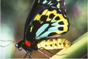
Exotic Butterfly House, Thames.