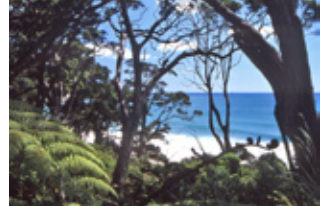
Take the walk to Orokawa Bay.

The translation of the Maori place name Te Aroha is 'Place of Love' and the naturally hot soda water makes it special to this day. The small and friendly town is nestled against the southern-most tip of the Coromandel hills, (Mt Te Aroha 952m). So don't miss the hot water pools and spas and the Te Aroha Domain with the original Edwardian spa buildings and Museum. The Government's Department of Conservation (DoC) operates campsites, walking tracks, but accommodation and historic sites throughout this region. The walks and huts of the Kuaeraanga Valley and historic Karangahake Gorge are highlights of the region. For more information see DoC's own brochures.