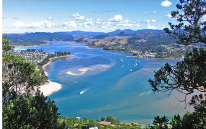
The Tairua Harbour from the top of Paku Hill with Pauanui to the left.