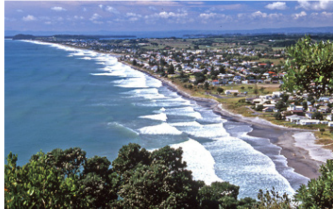
Waihi Beach, 9ks long, one of the Peninsula's most enjoyed beaches.