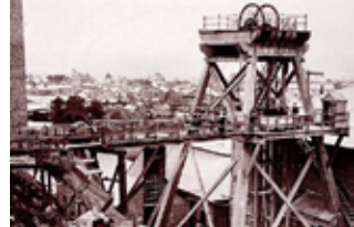
Thames, gold discovered in 1867

The wider Thames Region has a more diverse range of activities than any other area - from hot pools, to overnight tramping in the Kuaeraanga Valley, skydiving to butterflies, hire a bike or take an olde gold mine tour. Check out the town: the museums, the old pubs and the history - learn about the outrageous goldrush days when the town was the second biggest centre in the country! You can Base yourself in Thames and see the Peninsula with day trips. Included in this region is the Thames Coast with family safe beaches and spectacular sunsets. The quieter Seabird Coast on the west side of the Firth of Thames is an alternative route to/from Auckland and the Airport. And don't miss the Miranda Hot Pools!