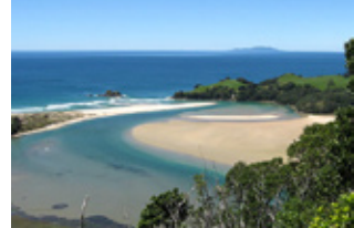
Beautiful Opoutere Estuary.

Whangamata is the Coromandel's top surf beach resort. Partly sheltered by off-shore islands, the curved beach is just the best for safe surf swimming and all beach fun. The harbour bar creates a surf break which is internationally famous with surfers. The well kept town has plenty for the visitor: all the shops, good cafes and bars, accommodation, surf club, golf and bush walks. Charter boats for fishing and scenic trips are operating from the impressive new Whangamata Marina. The Whangamata Beach Hop is a famous, annual, late summer celebration of 'Rods and Rock n Roll'. Nearby Whiritoa and Onemana are top sandy beaches with one and one's a hot one to relieve those aching muscles.