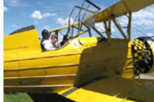
Joy flights at Thames Aerodrome.