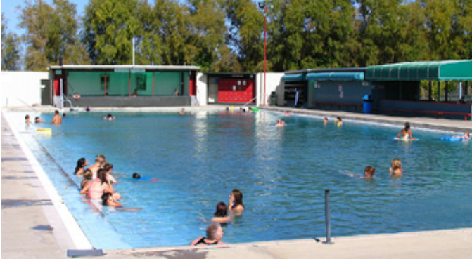
The large naturally hot mineral water pool at the Miranda Hot Springs.