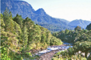
Open spaces of the Kuaeraanga.

VISITOR GUIDE: This southern part of the Coromandel Peninsula which includes Thames, Whangamata and Te Aroha has plenty for the visitor: excellent cafes, restaurants and bars, a winery, all types of activities including old train rides, gold rush history, museums, walking and tramping, sightseeing, gardens, fly fishing, shopping, surfing, art and all beach fun. The superb natural hot pools at Miranda, Te Aroha and Athenree are an all year activity. Do the Hot Pool Tour, summer or winter! Choose from all types of accommodation - motels, B&Bs, backpackers, lodges, alternative retreats, garden chalets and holiday parks.