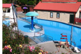
Hot pools in the Domain, Te Aroha.