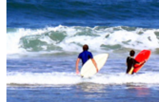
Surf's up on the east coast.

Waihi Town (pop. 4500) is the southern gateway to the Peninsula. The town services the region and has good accommodation, cafes, art, museum (check out the two thumbs!), old pubs and a very large open cast gold mine, take a tour! The superb, 9k long, white and sandy Waihi Beach is well enjoyed by visitors. The beach township at the north and has everything for the holidaymaker: shops and accommodation, cafes and bars, surfing and all beach fun. Try the coastal walk to the beautiful Pohutukawa tree line at Orokawa Bay - the best short walk on the Peninsula. Then the Holiday Park at nearby Athenree has natural hot pools and one's a hot one to relieve those aching muscles!