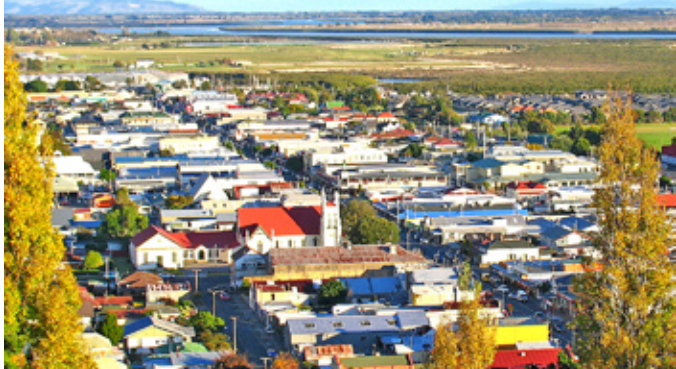
Thames, once a bustling gold rush town, now 'Capital of the Coromandel'.