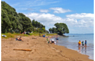
Friendly beaches, Thames Coast.