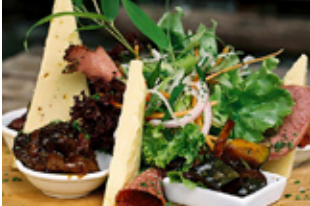
Dine in style at Ohinemuri winery.