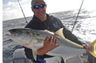
Fishing with Tairua Dive and Fish.