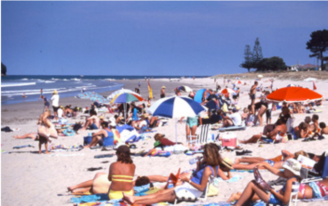
Whangamata, the Coromandel's top surf beach resort.