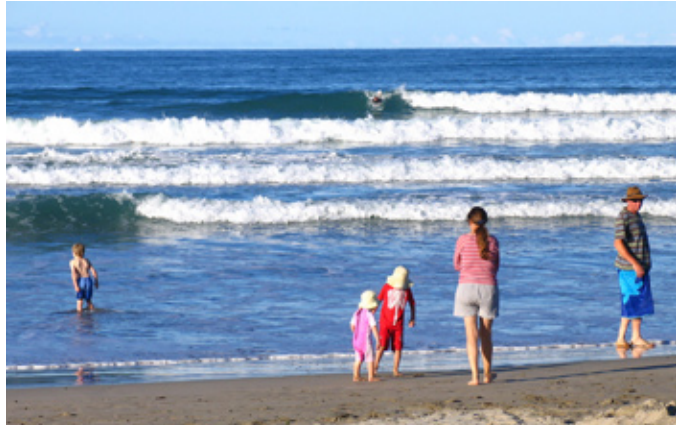
There are several family friendly surf beaches on this Pacific Coast.