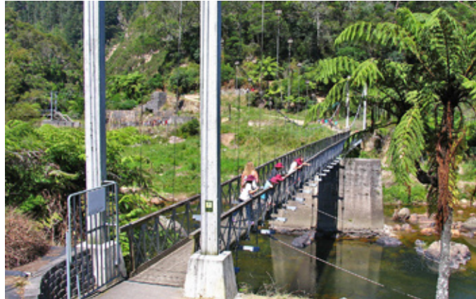
Take this bridge and explore the Karangahake and Waitawheta walkways.