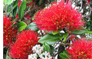
The red flowering Pohutukawa.

Opoutere has a pristine, 6k long white sandy beach with a tidal estuary, rare birds, the alternative Prana Eco Retreat centre with international workshops and festivals and high quality art at the Topadahil Studios. Tairua and Pauanui straddle the beautiful Tairua Harbour and a summer passenger ferry links the two. Tairua is on the main road with good cafes and accommodation. The main beaches are surf beaches, the harbour bays are more suited to family picnics and kayaking. Local activities include diving and fishing. Take the walk to the top of Pauanui, the big knob at the harbour entrance, for fine views. Pauanui is a beach house resort with an excellent surf beach and coastal walks.