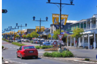
Waihi Town main street.