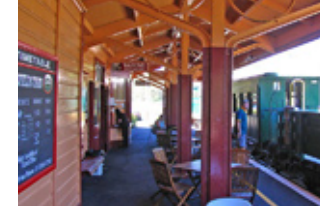
Goldfields Railway - train rides.

The township of Paeroa is a centre for events which include a Jazz Festival, Highland Tattoo and the popular annual motorbike 'Battle of the Streets'. Nine antique and collectables shops make the town a magnet for collectors and memorabilia hunters. The picturesque Karangahake Gorge on SH2 between Paeroa and Waihi is a fascinating area with plenty going on: enjoy the cafes, winery, farm park, waterlily gardens, top accom. and extensive walking tracks which include rushing waters with swing bridges, gold mines and old railway tunnels. The Goldfields Railway does rides from the old Waikino Station Cafe to Waihi and the old gold mining relics are worth a look. Trout fishing too!