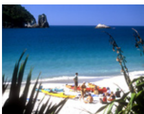
Kayaking at Hahei