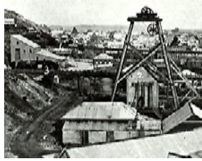
Olde gold rush days