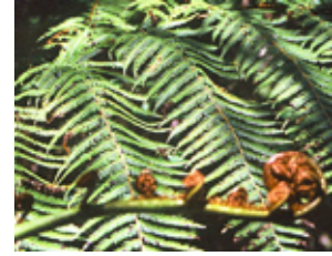
Clean and green