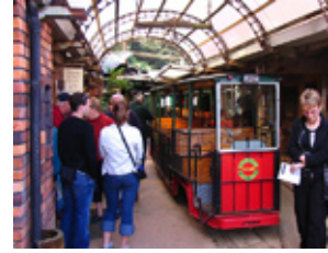
Driving Creek Railway