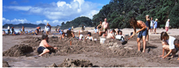
Natural spa baths at famous Hot Water Beach