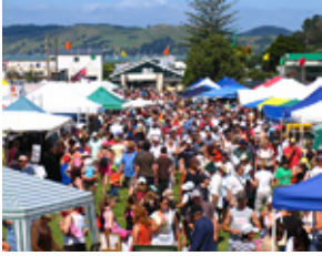
Coro's Keltic Fair