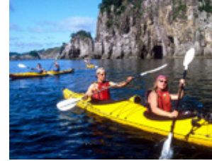
Kayaks at Hahei

Pull out the Tait's Fun Map again and take next left at Dalmeny Corner and along a meandering little road which services several of the most popular destinations on the Coromandel: Hot Water Beach, Hahei, Cooks Beach and Flaxmill Bay.