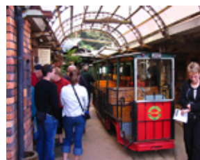
Driving Creek Railway

Your Coromandel Peninsula Holiday Guide - use together with Tait's Coromandel Fun Maps