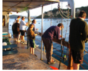
Mussel barge fishing