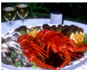
Pepper Tree seafood