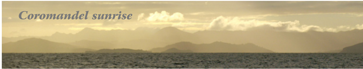
Early morning light over the Coromandel Peninsula from the Hauraki Gulf