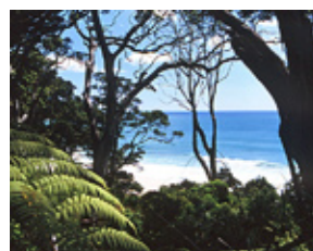
Orokawa Bay walk