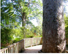
Waiau Kauri Grove