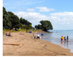
Safe family beaches