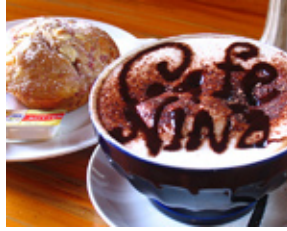
Coffee at Nina's