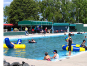
Miranda Hot Pools