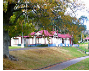
Te Aroha Domain